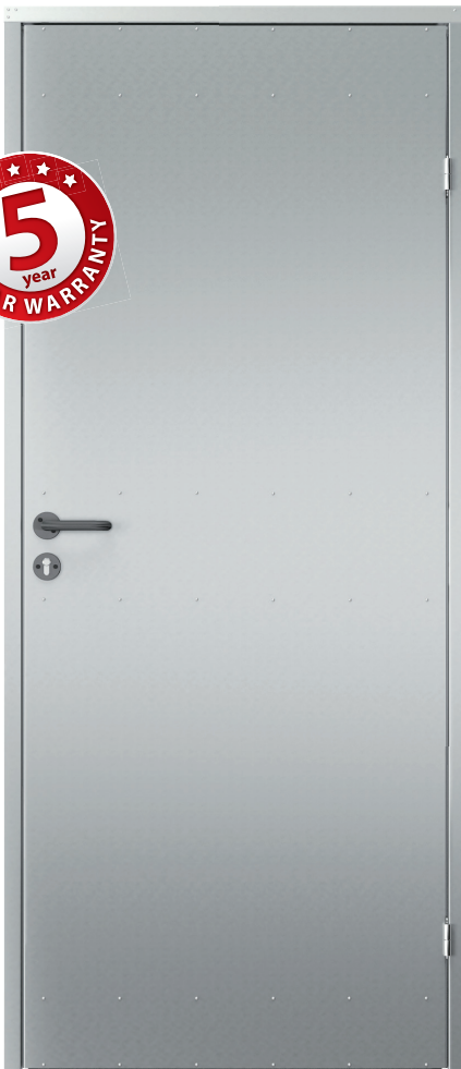
Model 1 "full", unpainted galvanised