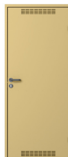
Model 2 with ventilation Cream (RAL 1001)