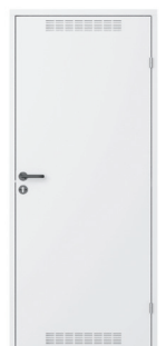
Model 2 with ventilation White (RAL 9016)