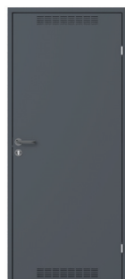
Model 2 with ventilation Anthracite (RAL 7024)