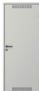
Model 2 with ventilation Grey (RAL 7047)