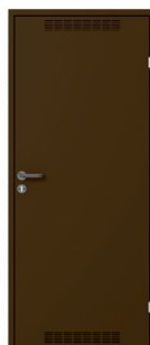
Model 2 with ventilation Brown (RAL 8028)